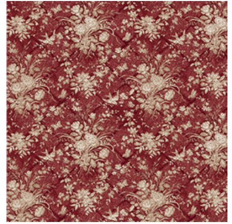
Eliza Floral in Sunbaked Red