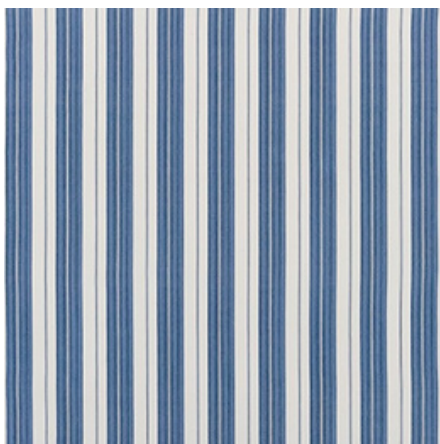
Joelle Ticking in Bleu