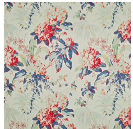
Washington Floral in Bunting