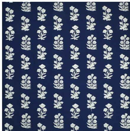
Blue Grotto Embroidery in Royal Blue