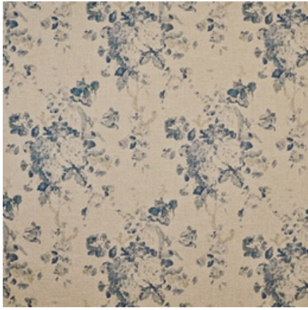
Jardin Floral in Artists Blue