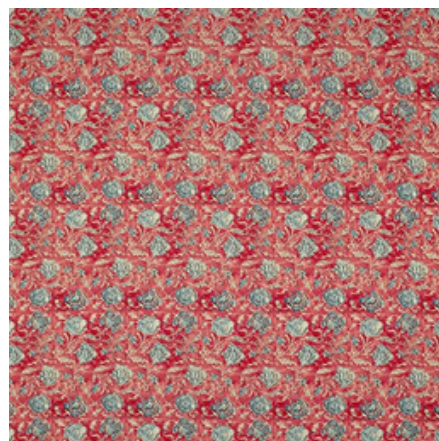
Shell Beach Batik in Scarlet