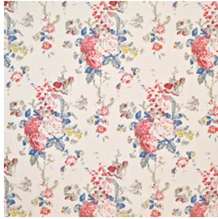
Jardin Floral in Summer Canvas