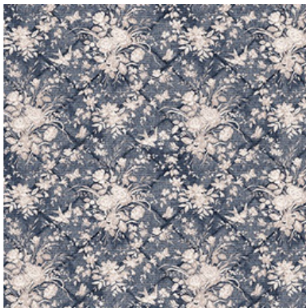
Eliza Floral in Vintage Blue