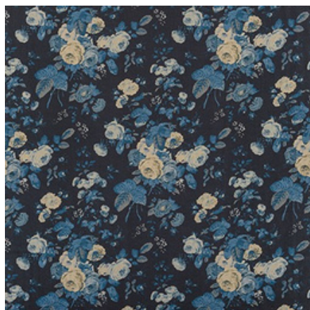
Tallulah Floral in Indigo