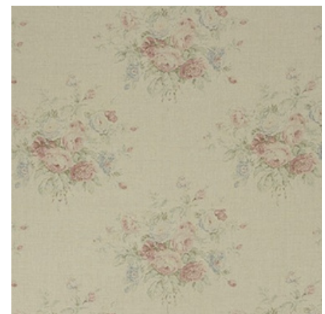
Wainscott Floral in Vintage Rose