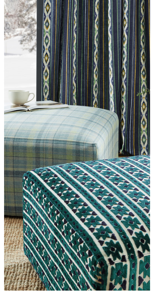
Chalet Arctic & Mineral